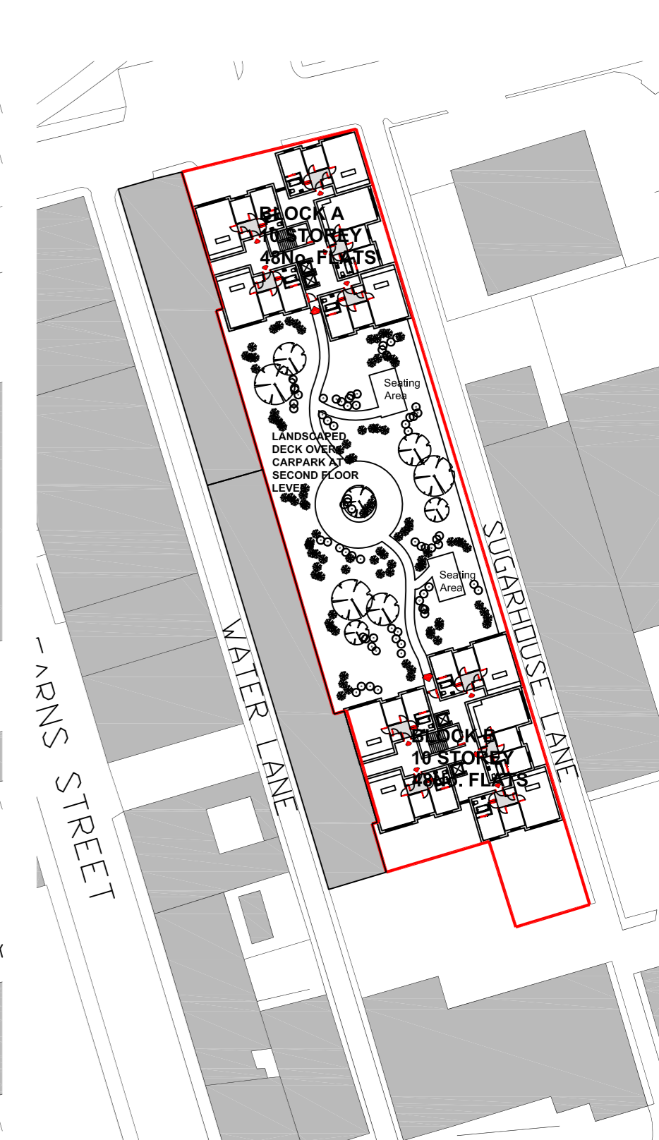
Second Floor Plan - Scale 1/500 Upper Floor Plans Similar