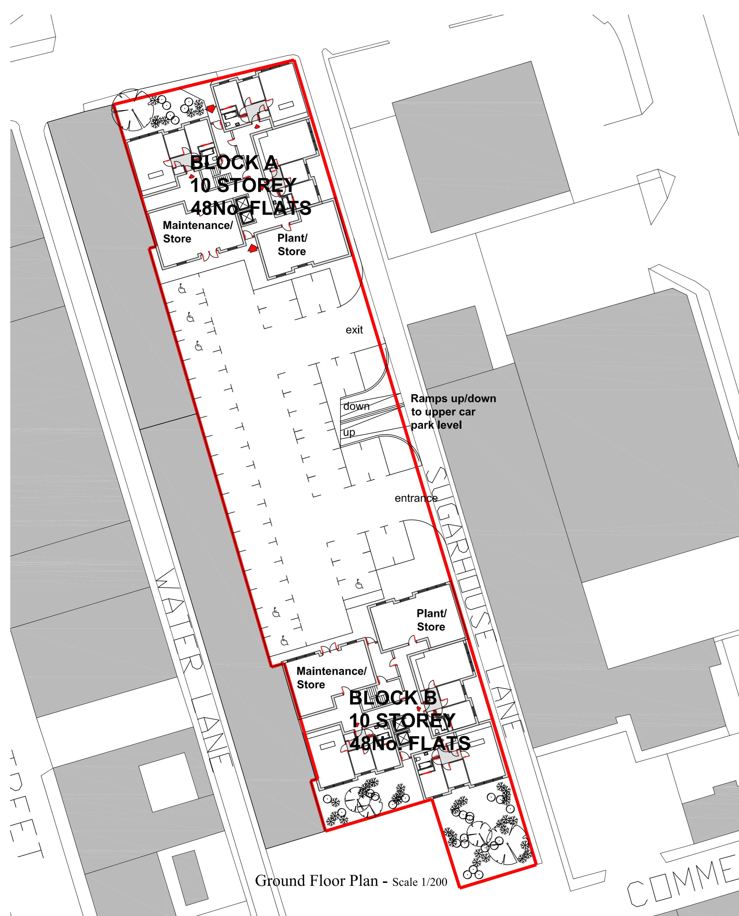
Ground Floor Plan - Scale 1/200